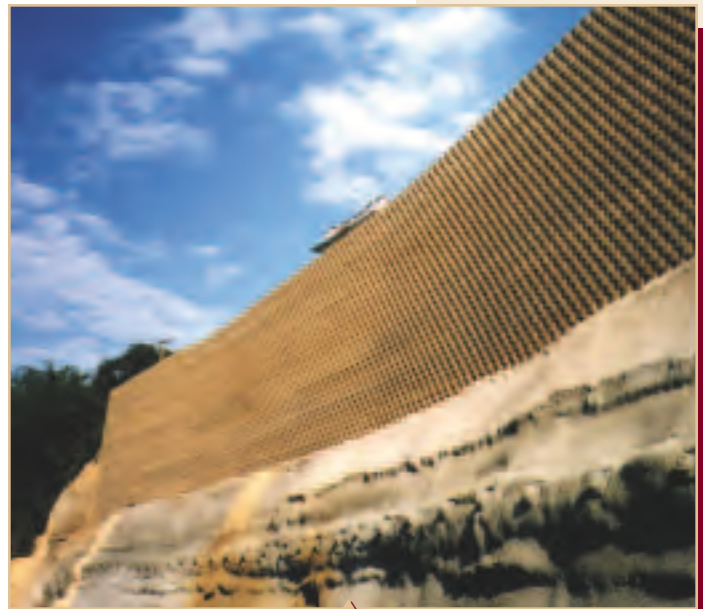
32’ High Keystone Wall solves the historic “Natchez Bluff” problem!