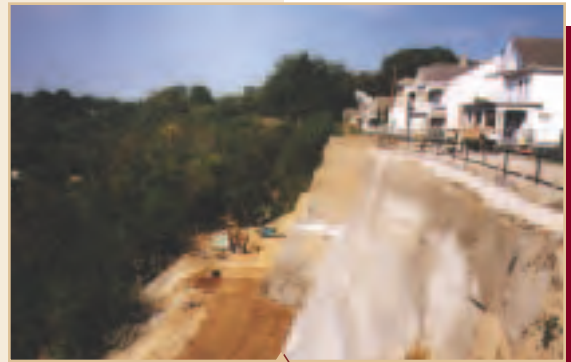
The top of the Keystone wall provides new front yards for bluff homeowners.

Conventional fill, such as sand, would have cost about $5 per cubic yard placed, while the cost of the lightweight aggregate solution was approximately $30 per cubic yard placed. This lightweight material was needed to solve the problem due to the inability of the underlying wall to carry the load of the conventional fill. Combining these various stabilization systems was an economical and yet ideal solution.