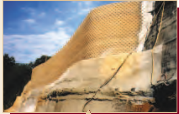
View of wall with soil nailed “bench” below.

“bench” or shelf 25’ out toward the river from the stabilized wall. The section above this bench was cut back 10 ft. (3.0 m) and the remaining area was stabilized with geogrid soil reinforcement and filled with 6,000 lbs. of lightweight aggregate, topped with sod and plants. One sidewall of the section is the original bluff, and the back wall of the section is the shotcrete-covered soil-nailed wall.